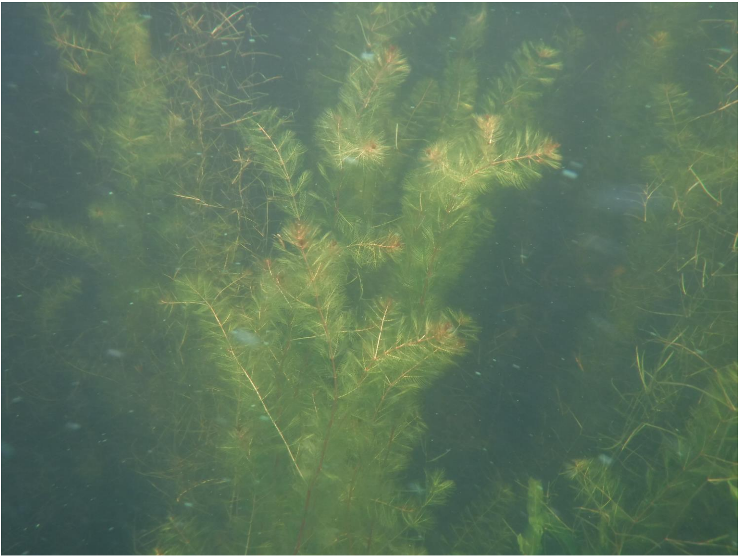
Photo 2: Underwater picture of Eurasian watermilfoil taken on 9 July 2024 on Sand Lake.

Eurasian watermilfoil was found at depths ranging from 4.0 - 8.0 feet but was found growing most commonly at 4.0 feet deep. Eurasian watermilfoil was not growing in dense stands as it has historically, and plants were not robust. Individual plants, clumps or patches were common, especially in areas that were treated with herbicide in 2023. Eurasian watermilfoil was growing predominantly in the west end of Sand Lake with only a few plants found elsewhere.