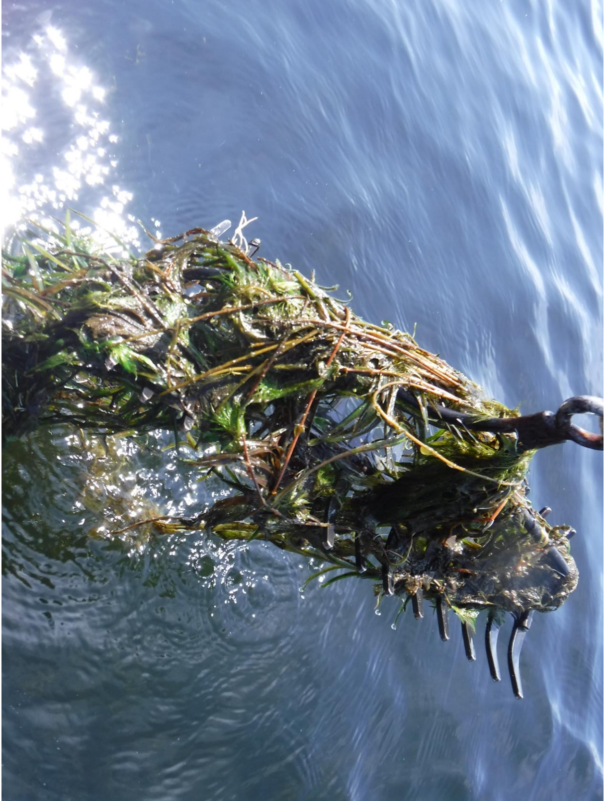
Photo 3: Eurasian watermilfoil mixed with a few natives on a rake from Sand Lake, 2 June 2023.