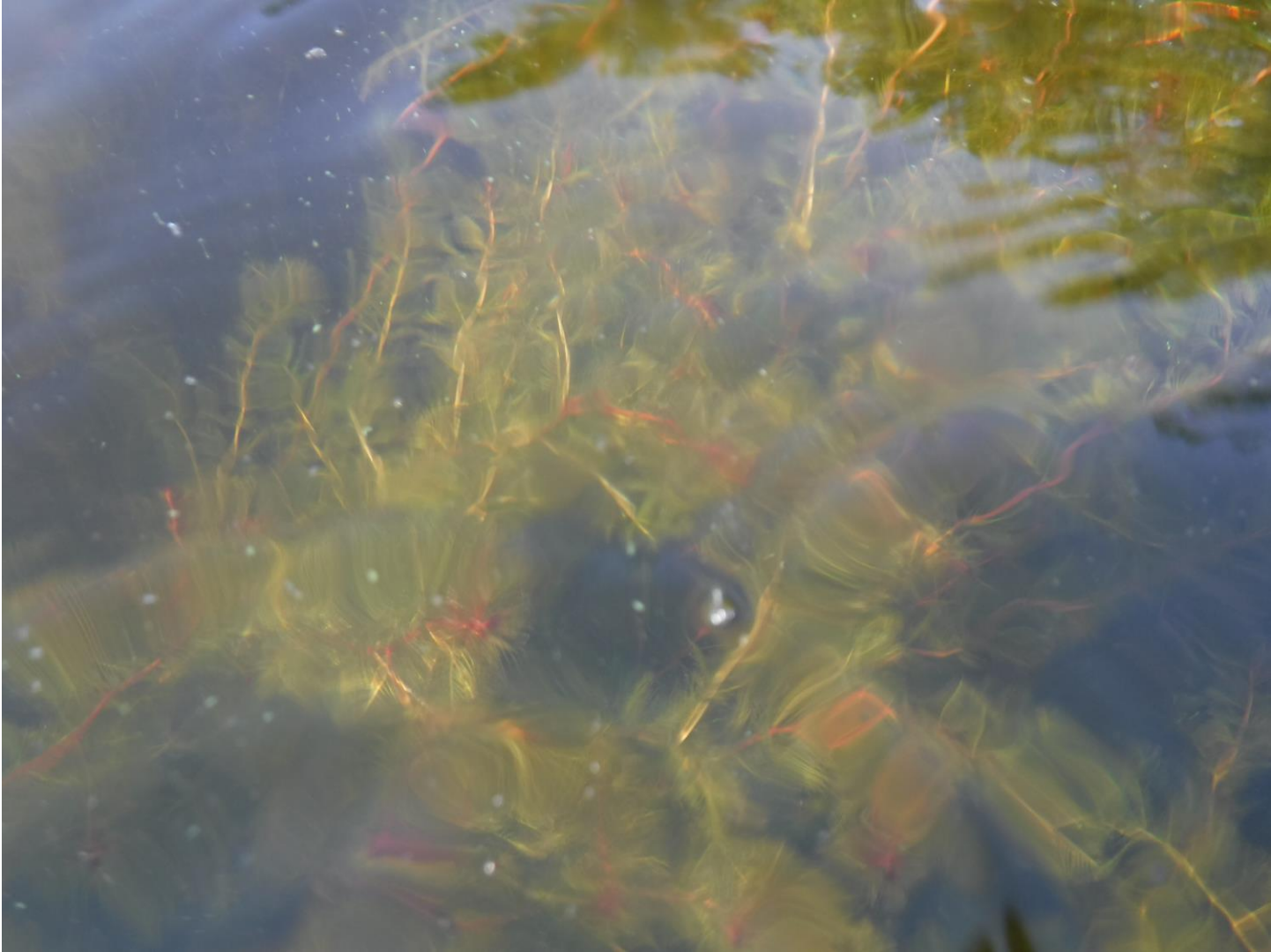
Photo 4. Eurasian watermilfoil near the surface of the west side of Sand Lake on 9 July 2024.